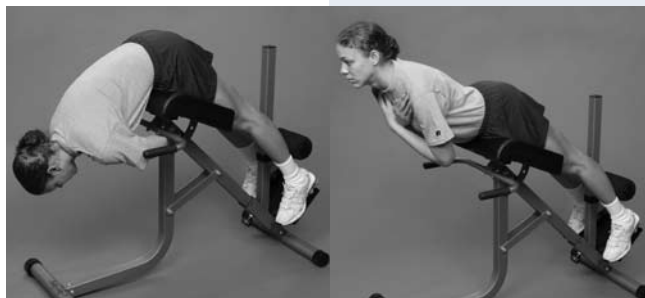
Figure 11. Roman Chair Extension: This is a more advanced exercise and may not be appropriate for everyone. Hip pad is placed at the crest of the hips. Bend forward as far as possible and lift the trunk using your low back muscles. Perform exercise slowly (3 count up and 4 count down). Repeat 5-10 times.