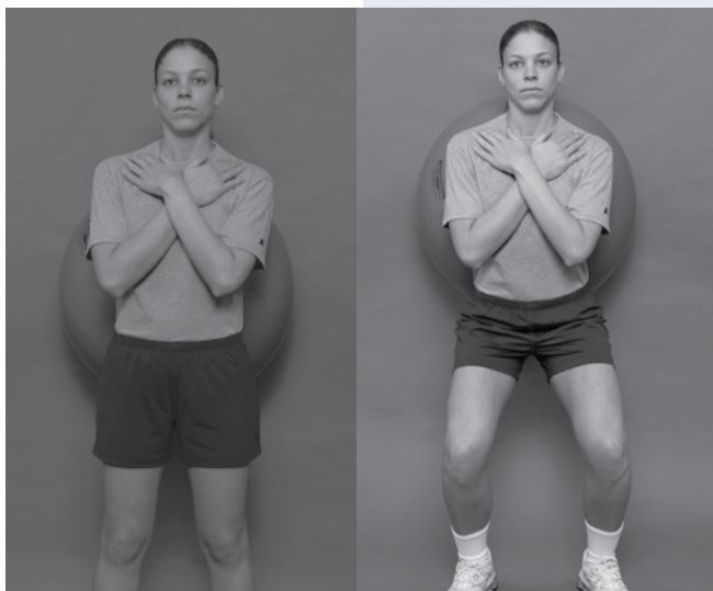
Figure 16. Ball/Wall Stand: Stand with straight knees and ball at your back. Bend knees slowly (3 second count) to three quarters position and hold for 5 seconds. Return to standing position slowly (3 second count). Repeat 5-10 times.