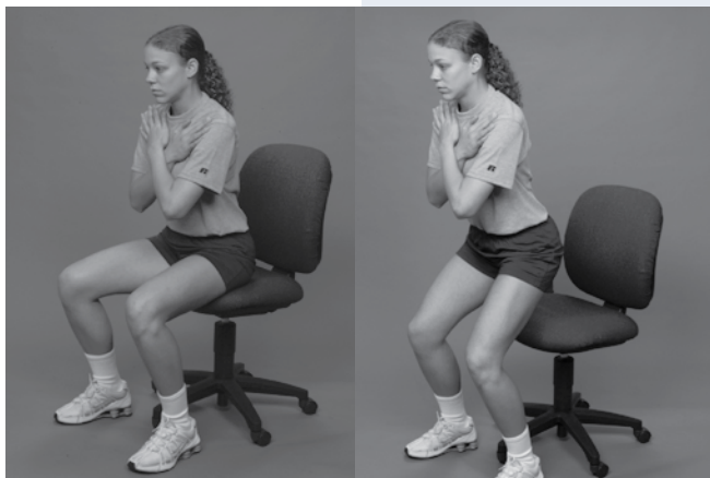
Figure 15. Chair Stand: Sit with arms across the chest; stand slowly and slowly return to seated position (count to 3 up and 3 down). Repeat 5-10 times.