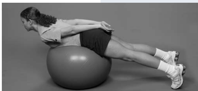
Figure 10. Face-Down Ball Extension: Place hands behind the back and lift head and shoulders upward. Hold for 5-10 seconds. Repeat 3 times.