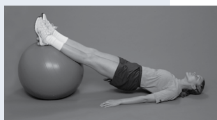
Figure 14. Supine Ball Extension: Place hands on the floor and raise hips from the floor. Hold for 5-10 seconds. Repeat 3 times.