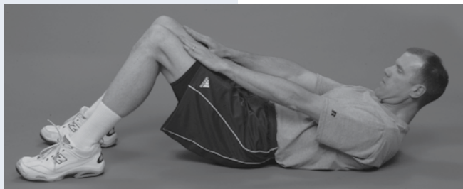
Figure 12. Curl Up: Place arms out toward the knees, tilt pelvis to flatten back. Raise head and shoulders from the floor. Hold for 5-10 seconds. Repeat 3 times.