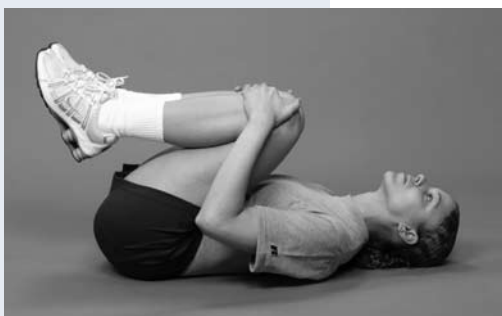
Figure 8. Double Knee-to-Chest: Pull both knees up to the chest and gently pull for 10 seconds. Repeat 3 times. Be sure pain is not getting worse. Unless pain is getting worse, perform 2-3 times per day.

Figure 7. Single Knee-to-Chest: Pull one knee up to the chest and gently pull for 10 seconds. Repeat 3 times. Do this for each leg.