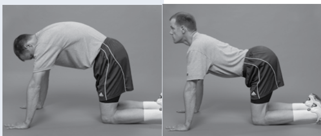
Figure 13. Cat/Camel: Place hands under the shoulders and knees under the hips. (1) Raise and round back by contracting the stomach muscles. Hold for 5-10 seconds. (2) Release and let the back sag.