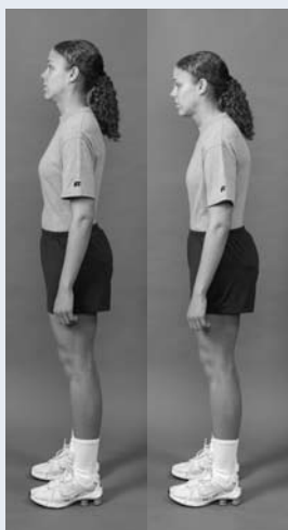
Figure 5. Standing Posture: Draw the head backward, tucking your chin; ears and shoulders should be vertically aligned with the hips and balanced above the legs ( good posture on left; poor posture on right ).