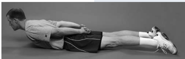
Figure 9. Face-Down Extension: Place hands behind the back and lift head and shoulders from the floor. Hold for 5-10 seconds. Repeat 3 times.