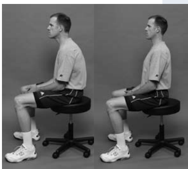
Figure 6. Seated Posture: Ears and shoulders should be aligned over the hips, reproducing the same hollow in the low back as when standing ( poor posture on left; good posture on right ).