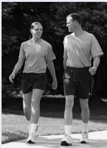
Figure 1. Walking: Begin with 10 minutes and increase to 30 minutes or more. Increase distance and pace as tolerated.

*See text for indications for each exercise.