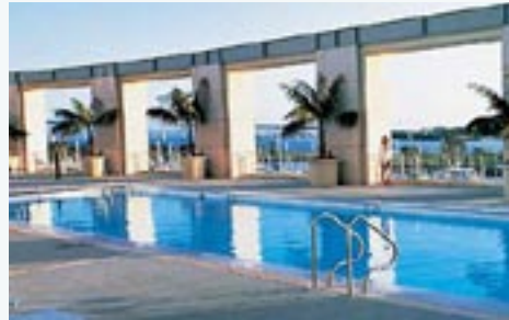
Ocean views from the pool at the Manchester Grand Hyatt San Diego, location of the this year's Annual Meeting Welcome Reception.