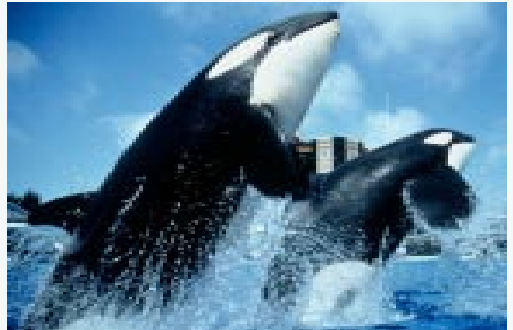
Sea World of San Diego, home to world famous Shamu, is one of several enjoyable, memorable tours available during NASS' 18th Annual Meeting in San Diego (see story on this page and next).

La Jolla isn't just another tourist town. "The jewel," is an apt description of this charming village with its many upscale boutiques, fine restaurants, art galleries and charm of a Mediterranean isle. The shopping in La Jolla is incomparable! See the latest fashion trends, explore