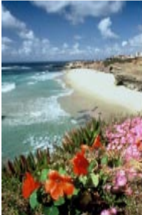
La Jolla Cove