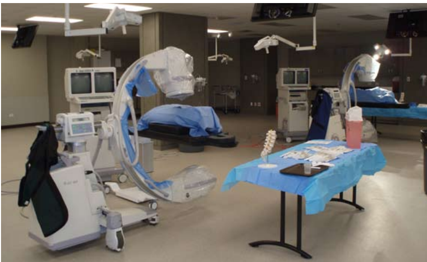
The Spine Masters Institute hosted 33 courses during 2008.

NASS has nine courses slated for 2009 at the Spine Masters Institute: two basic injections courses, an advanced injections course, three hands-on surgical courses, an advanced PA/NP surgical skills course, an exercise course and rehabilitation medicine for surgeons course.