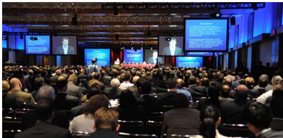
A total of 105 podium presentations, 97 special interest paper presentations and 189 posters were featured over the four-day meeting.