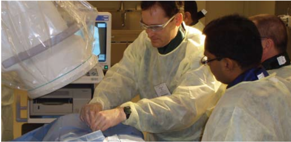
A February Lumbar Spinal Injections course was one of seven NASS courses held at the Spine Masters Institute in 2008.