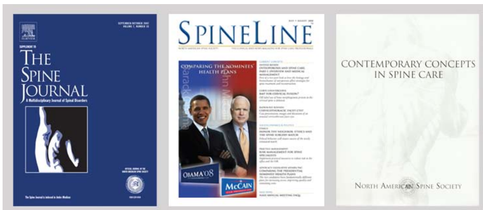
The Spine Journal, SpineLine and Contemporary Concepts in Spine Care are three of the many periodicals, serials and other publications produced by NASS' publishing program.

In 2008, the Task Force revised and reprinted several existing brochures. The series now includes over 30 brochure titles, available as printed pamphlets for spine providers to use with their patients. Patients may also view (and download) each brochure on the NASS Web site at www.spine.org . Top selling print versions are Lumbar Spinal Stenosis, Herniated Lumbar Disc and Spinal Injections, which are also among the most visited pages on www.spine.org .